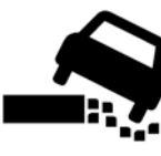
TS1110 ▶1 A8