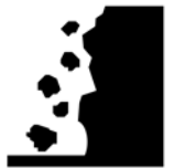
TS1140 ▶1 A11a, A11b