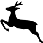
TS1200 ▶1 A15b