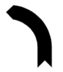
TS0980 ▶1 A1a, A1b