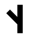
TS1280 ▶1 A18d(a, b)